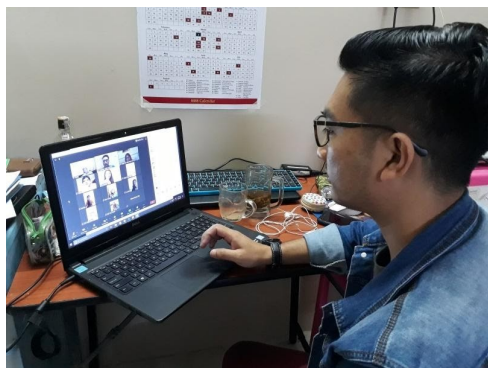
stress management and self-care online training to human rights defenders

https://www.facebook.com/permalink.php?story_fbid=1222456111420222&id=100009675341030&_tn=K-R https://www.facebook.com/100009675341030/videos/1218134581852375/?id=100009675341030 https://www.facebook.com/photo.php?fbid=1216435098688990&set=a.123059904693187&type=3&theater