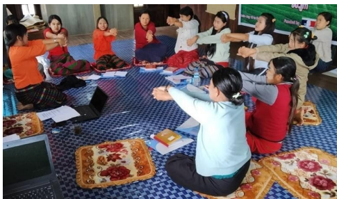
Stress management and self-care training in Namhsan, northern Shan State