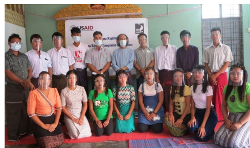
Human Rights, Complaint Mechanism, Transitional Justice and Documentation of Human

The Assistance Association for Political Prisoners (Burma) (AAPP) held two trainings on Human Rights, Complaint Mechanism, Transitional Justice and Documentation of Human Rights Violations Basic Training in Maubin, Ayeyarwady Division in the month of August. A 12-day training from