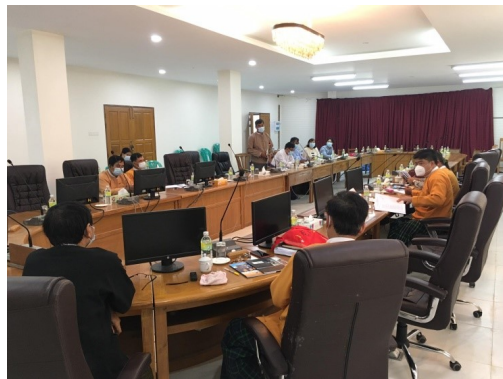
Meeting with Ayeyarwady Hluttaw MP's

On August 28, there was a meeting between a representative group led by the Assistance Association for Political Prisoners (AAPP) and MP from Ayeyarwady Division Hluttaw of the Ayeyarwady Division. In the meeting, “Mapping Injustice in Myanmar Report, which was written by AAPP and its partner organizations, was introduced and the contents of the report were discussed.