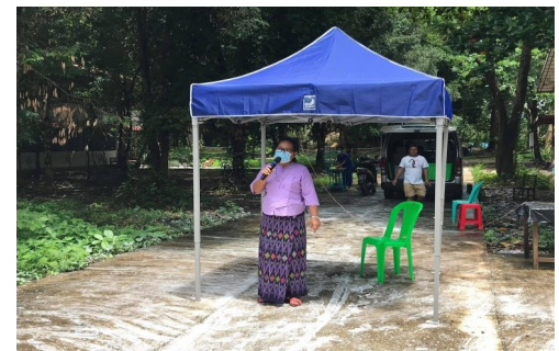
Mental Empowerment Talk at Quarantine Center in Patheingyi University