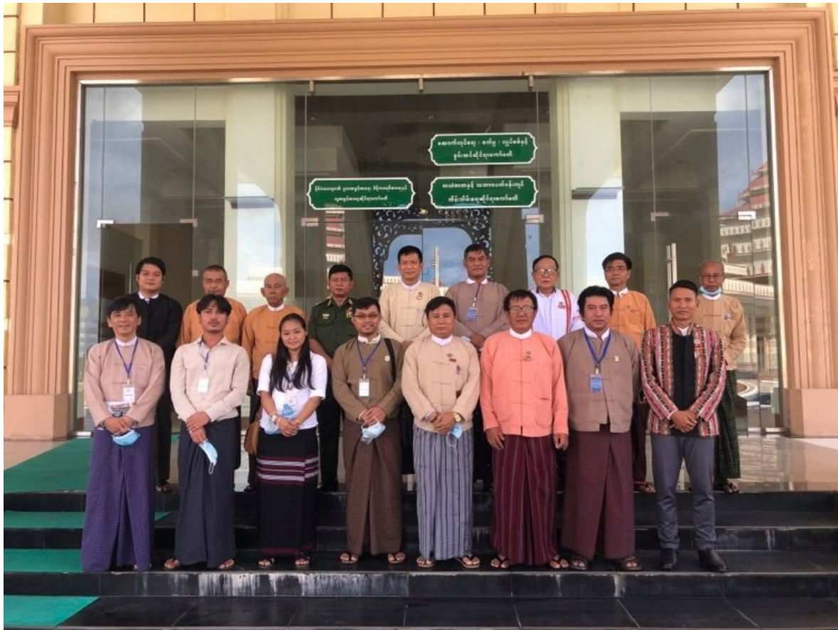
AAPP and partner organizations with the Committee on the Human Rights, Democracy and Basic Rights of the Citizens