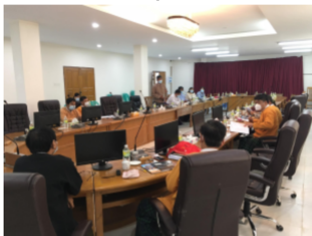
Meeting with Ayeyarwady Hluttaw MP's

On August 28, there was a meeting between a representative group led by the Assistance Association for Political Prisoners (AAPP) and MP from Ayeyarwady Division Hluttaw of the Ayeyarwady Division. In the meeting, “Mapping Injustice in Myanmar Report, which was written by AAPP and its partner organizations, was introduced and the contents of the report were discussed.