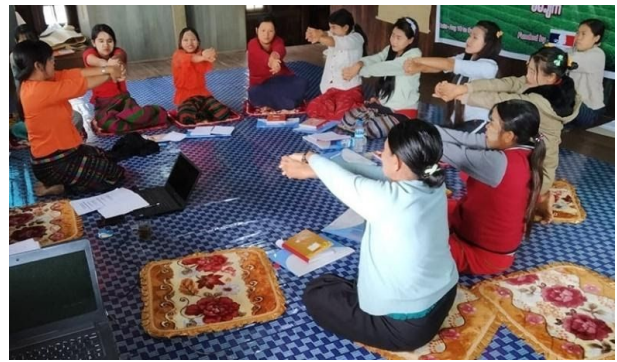
Stress management and self-care training in Namhsan, northern Shan State