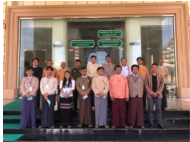
AAPP and partner organizations with the Committee on the Human Rights, Democracy and Basic Rights of the Citizens