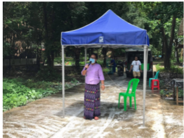
Mental Empowerment Talk at Quarantine Center in Patheingyi University