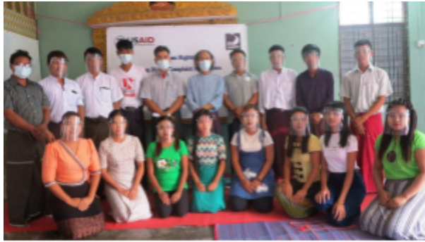
Human Rights, Complaint Mechanism, Transitional Justice and Documentation of Human Rights Violations Training in Maubin, Ayeyarwady