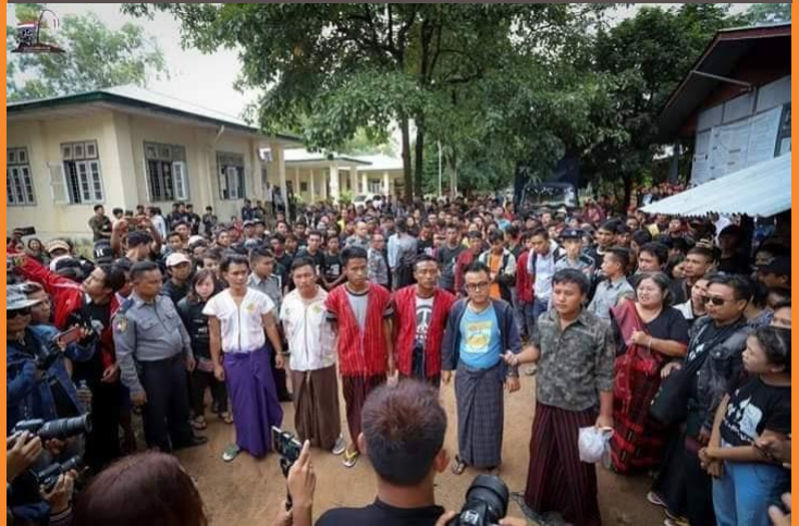
Six Karreni activists imprisoned for protesting General Aung San statue construction