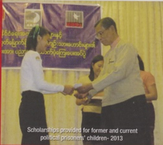
Scholarships provided for former and current political prisoners' children- 2013