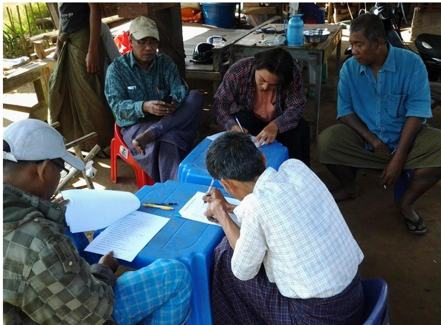
FPPs complete the surveys whilst the data collector looks on

In areas where the data collectors were unable to administer the survey with the FPPs, surveys were distributed at collection points to be self-administered by the FPPs and returned back to AAPP. Family members filled in surveys on behalf of deceased FPPs. In total, approximately 5,000 surveys were distributed; thus far, AAPP has received back 2,849 surveys.