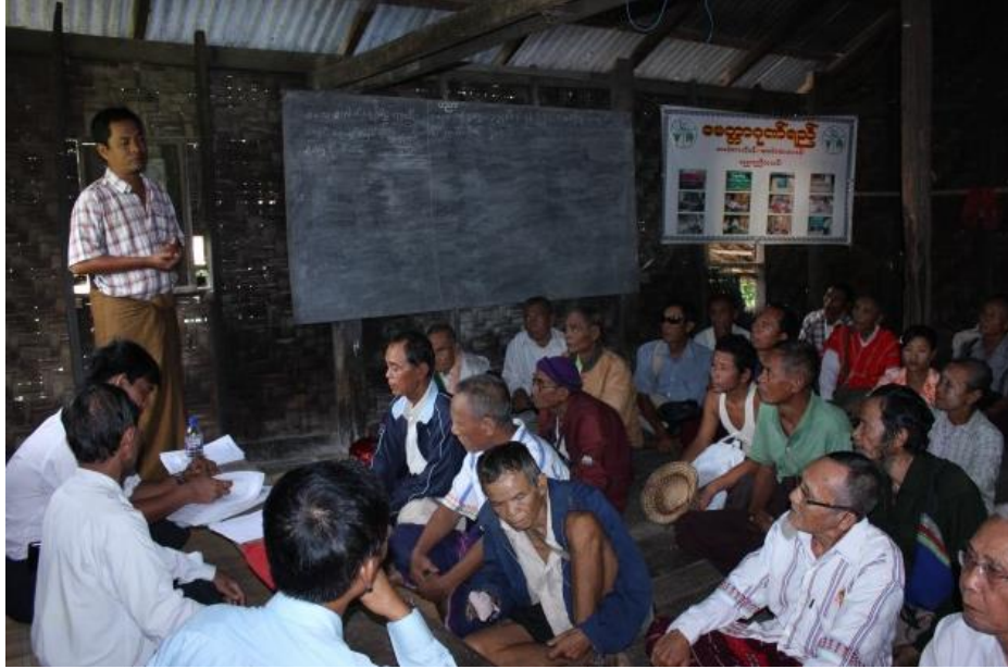
A data collector explains the Documentation Project to FPPs in Kyaunggon

In areas where the data collectors were unable to administer the survey with the FPPs, surveys were distributed at collection points to be self-administered by the FPPs and returned back to AAPP. Family members filled in surveys on behalf of deceased FPPs. In total, approximately 5,000 surveys were distributed; thus far, AAPP has received back 2,849 surveys.