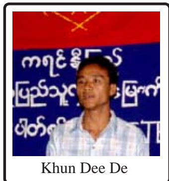
Khun Dee De

Three young Karenni activists helped organise 'Vote No' campaign activities in late April, including spraying the symbols for 'No', 'X' and 'Vote No' on government signposts and walls, and distributing 'Vote No' pamphlets.