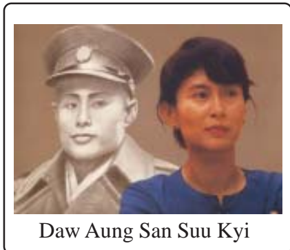
Daw Aung San Suu Kyi

There are at least 430 members of the National League for Democracy – including 12 elected MPs 12 - behind bars in Burma today, the largest single group of political prisoners. For more than two decades NLD members have been arbitrarily detained, harassed, imprisoned and even killed 13 in order to prevent them assuming the power granted to them by the people of Burma in the 1990 elections.