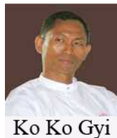
Ko Ko Gyi