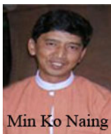
Min Ko Naing