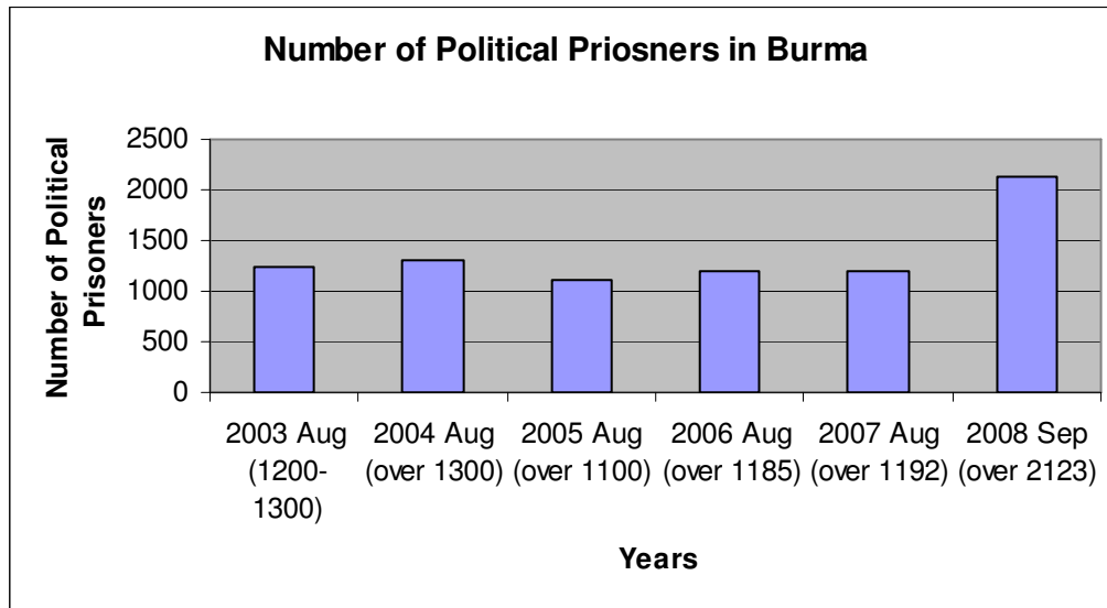
CHART No. 1