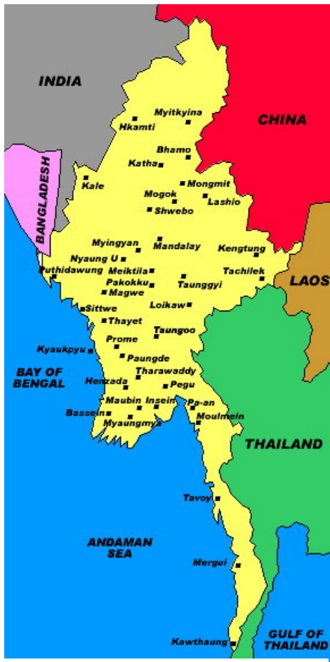
Map of prisons in Burma

One of the major concerns for Burma's political prisoners right now is the impact of prison transfers. The medium to long-term effect of prison transfers on political prisoners' health is likely to be very serious, and may directly result in more deaths in prisons.